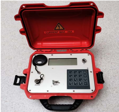
I-Fullwaver, compact recorder for full wave