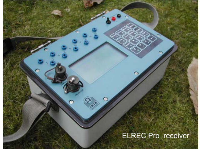
ELREC Pro receiver