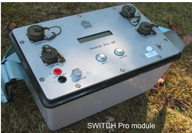
SWITCH Pro module